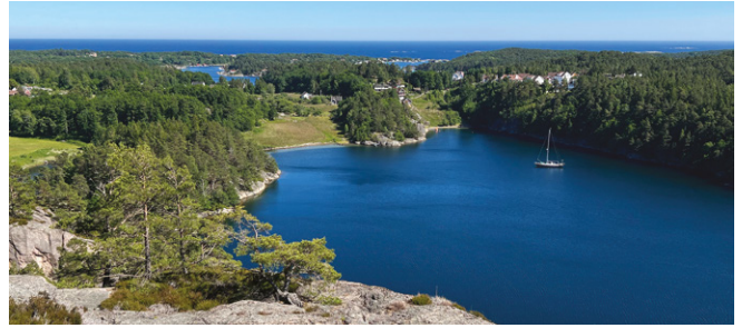
View S over Lusekilen from the top of Videheia to its N Hamish Wilson

Anchorage N of the Blindleia, SSE of Ingridnes. Anchor near head in 10m; mud. Good view from top of Videheia to N