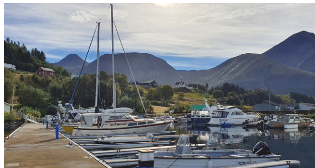
Sætre (Vartdal) Hans-Petter Sandseth

The village is Sætre. The marina is Vartdals Småbåtlag. N/S concrete pontoon. Moor on E and N sides. Toilet in service building. Payment by Vipps.