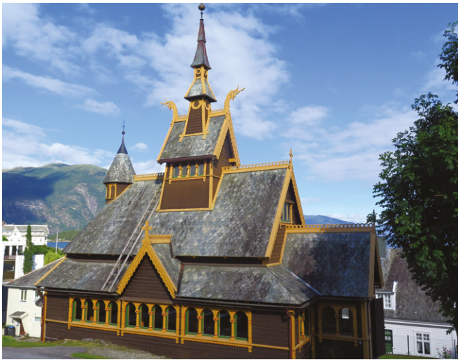
The English church in Balestrand John Sadd

On the corner of Sognefjord's junction with the short (2M) Esefjord; 2M S of its junction with Fjærlandsfjord. Wooden guest quay, N of Kviknes Hotel (hotel guest berths). Visitors' berths in small boat marina. Water, electricity; toilet, shower, washing machine. Unusually for a Norwegian fjord, Esefjord has reasonable anchoring depths (mainly 12-14m, less as it narrows towards its NE end). Museum of Tourism. Sognefjord Aquarium. 'English Church' (St Olaf's), built in 1897 in the style of a stave church, is dedicated to the English wife of Knut Kviknes, owner of the Kviknes Hotel.