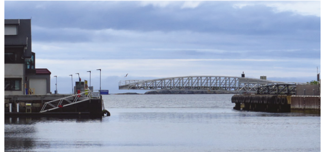
Pedestrian swing bridge, Fosnavåg John Sadd

Swing bridge across harbour entrance; mainly open but closes for pedestrians. Marked by flashing orange lights. Electricity and water on guest pontoons. Fuel (diesel, petrol) on first pontoon to starboard after mole. Rimøy should be Remøya.