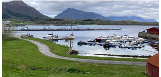
Leirvikbogen looking NW past guest pontoon and fish factory John Sadd

Add Passage under the bridges across Flagsund S of Engeløy is between islands Ålstadøy (Ål) and Bogøya (bridge 25m). Although bridge clearance S of Bogøya is 25m, there is also a 6m cable and only 1 m depth. N of Ålstadøy the bridge is low (1.3m) curving NW/NE to Engeløy. Showers and launderette in club house. Supermarket. Fast ferries to Bodø and Svolvær.