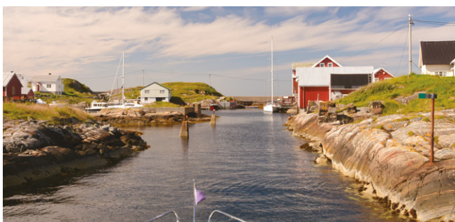
Bjørnsund. Narrow entry. Yacht alongside on guest quay

Not advised, although in settled weather this might be possible N of Nordre Bjørnsund in the bay between Måøya to its NW and the causeways lining it to Måøya (11m; open to NE).