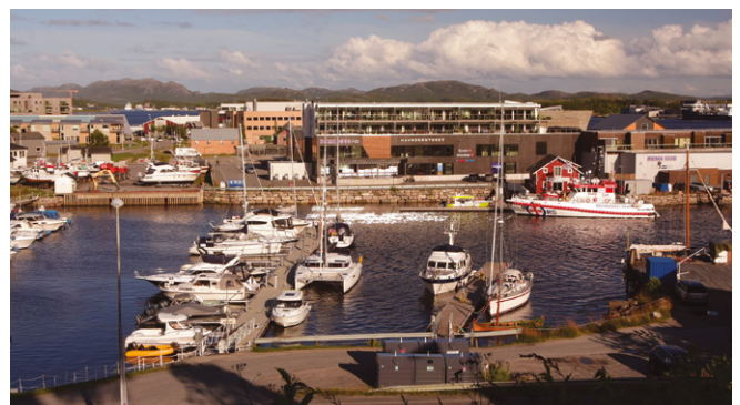
Rørvik. Guest berths on the first pontoon and right side of second

Guest berths both sides of first pontoon and S side of second pontoon. No WiFi in harbour. Clubhouse open 0700-2400. Town marina payment via GoMarina. Bank does not handle cash, and nowhere to get cash: no ATMs or supermarket cashback on UK debit or credit cards in 2023. Beer no longer available from warehouse on Norol jetty.