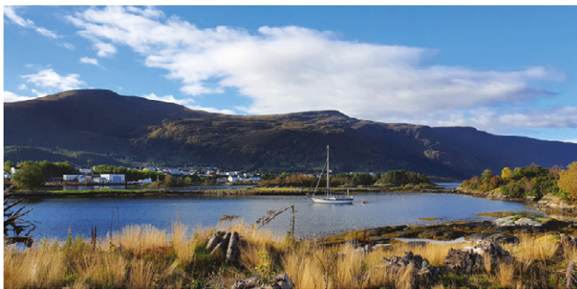
Gåsholm/Flatholm lagoon

Sheltered lagoon S of Flatholm and Gåsholm to N, entered from S between Tennholm and Bukholm (neither named on chart). Anchor, avoiding charted wreck and underwater cable to E between Gåsholm and Sula N coast; 3-14m. Moor alongside Flatøya. Moorng buoy (10 ton).