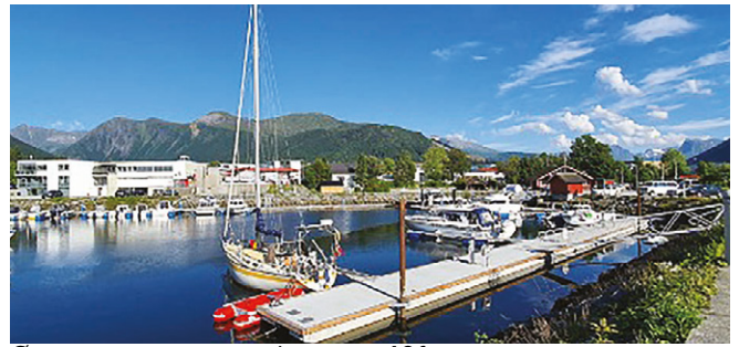
Ørsta guest pontoon, boats to 40ft Hans-Petter Sandseth

At head of 5M Ørstafjord. Stone mole. Pontoons. Depth to 2-2m, greater than it seems on chart (two 1m spots on small boat pontoons). Yachts to 40ft, depth to 2-2m, on NW pontoon. Water, electricity. Launderette. Fuel (diesel, petrol). Small town with shops, restaurants, hotels; Ørsta-Volda airport 3km. Spectacular mountain surroundings.