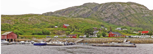
Utvorda hammerhead seen from exposed entrance John Sodd

Not yacht-friendly. Hammerhead nearest harbour entrance is exposed. Unlikely to be space on the three main pontoons. Short (6m) pontoon off quay.