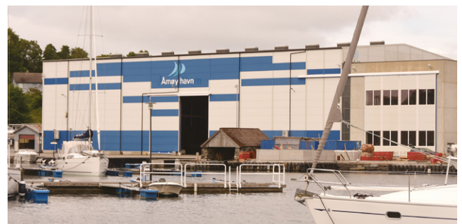
Åmøyhavn, Vestre Åmøy, winter storage halls John Sadd

☎+47 932 59 300, post@amoyhavn.no , www.amoyhavn.no