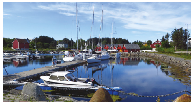
Finnøya, Harøyfjord guest pontoon

Mole harbour on NE corner of Finnøya at the top of Harøyfjord, connected by causeway to larger Harøya to its SW. Entered from N. Long guest pontoon and small boat marina in sheltered SW end; water, electricity; honesty box. Although this is charted as drying, 4m minimum has been experienced on the guest pontoon. Hostel. Clubhouse. Hotel. Marine engine museum (there was formerly a fishing boat engine factory on Finnøy).