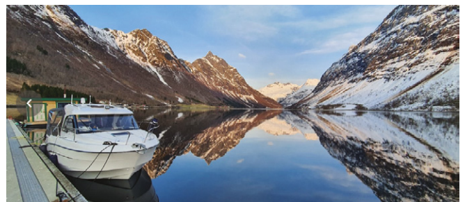
Urke Norangsfjord Hans-Petter Sandseth

Pontoons at W end of Urkebukta bay on N side of Norangsfjord, 1.3M E of junction with Hjørundfjord. Depth 10m. Electricity, water. Pub/café. In summer, local produce can be bought at a local farm. Good day mountain hikes