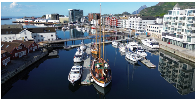
Svolvær: guest berths NE of bridge to Lamholm, looking across bridge to town centre berths John Sædd

More room for visitors with new pontoons NE of bridge to Lamholmen Island. Deeper (3+m) and quieter than outer end of the old longer pontoon near town square. Water and electricity.