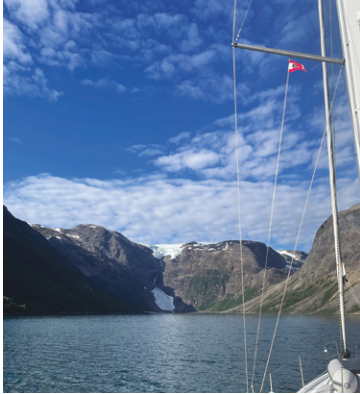
Jøkelfjord at midnight in early July Will Eaton

Good holding off Vika at 70°04'·3N 21°59'·2E; 8–10m. Local moorings and steep shelving make access to the anchorage marked 'J' tricky for more than one yacht. 'Ecopod' style hotel on the beach at Jøkelfjordeidet (position given in the book).