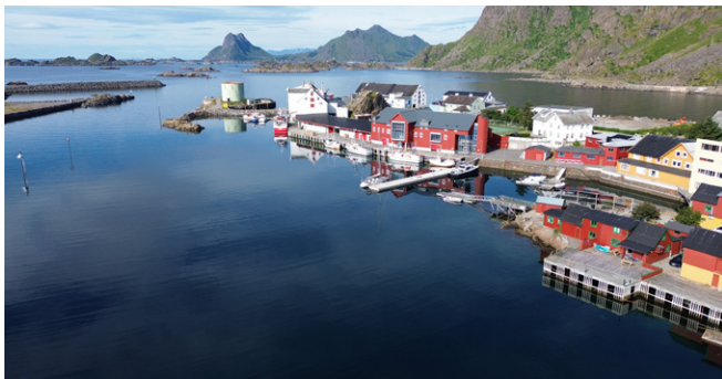
Stamsund: guest berths SW of pub and restaurant John Sædd