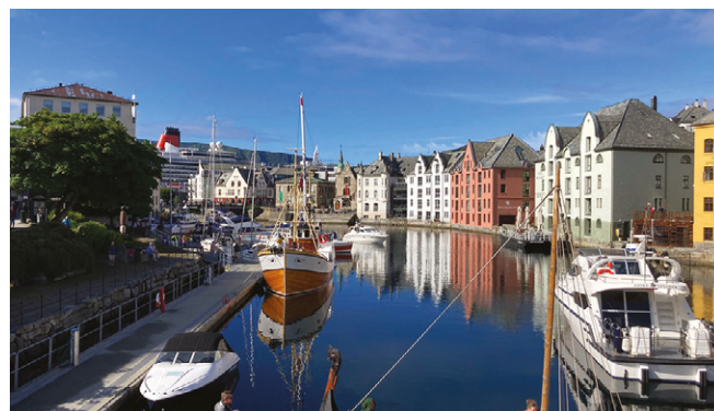
Ålesund harbour looking SW towards bridge at far end of Brosund

vakta-hav@alesund.havn.no alesund.havn.no