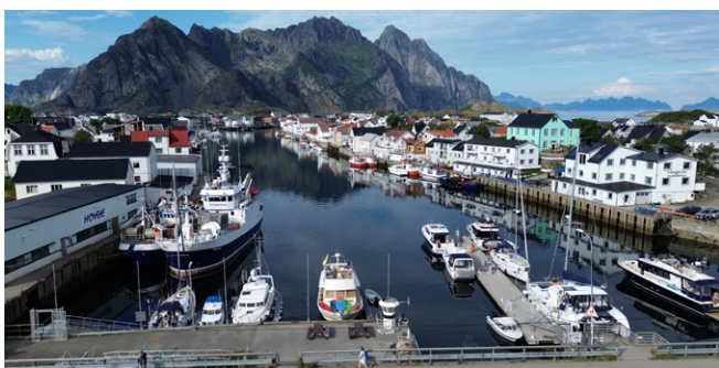
Henningsvær looking NE; main guest berths in foreground John Sædd

Add position: Anchorage to NE: 60°09'.9E 14°14'E