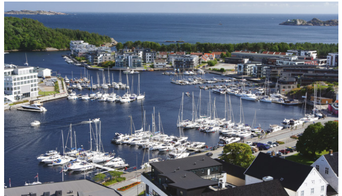
Mandal visitors' pontoons in foreground, looking SE to entrance John Sadd

☎+47 982 47 262, ☎+47 400 05 152, mandalhavn@mandal.kommune.no, gjestehavner/mandal-gjestehavn