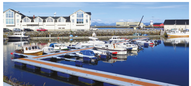
Steinshamn NE Harøya, guest pontoons John Sadd

Harbour on NE side of N tip of island at the top of Harøyfjord. Protected by breakwaters either side of entrance at position given. Small marina in NW corner, 2.3–3.1m alongside 80m-long NE visitors' quay, but possibly only 1.8m on approach past northernmost small boat pontoon; water and electricity. Small boat pontoons have less depth. Commercial harbour on W side of outer harbour, S of entry; anchoring would impede manoeuvring. Shops in Steinshamn village ½ mile away.