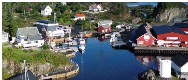
Værøyhamn looking past visitors' pontoon in NW corner of harbour John Sadd