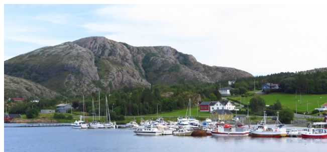
Sandnes hammerhead guest berths Wave-breaker port hand on entry. Fuel berth extreme right John Sadd

Guest pontoon in first marina on SE side of inlet. 25m hammerhead. 8m. Water, electricity. Most other berths occupied by locals. Supermarket. Fuel (petrol, diesel) on Coop pontoon. Exposed to N.