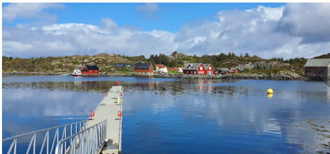
Pontoon at Hamnevågen, Sandøy Hans-Petter Sandseth

New concrete pontoon; c.120m long, to W on port side after mole. Electricity and water.