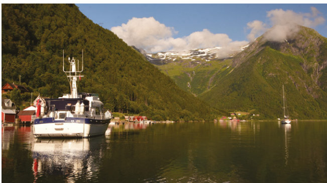
Esefjord, Balestrand small boat harbour and fjord anchorage