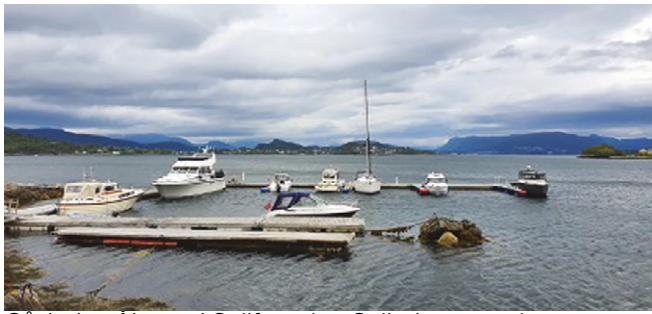
Gåsholm, Ålesund Seilforening Seilerhytte marina Hans-Petter Sandseth