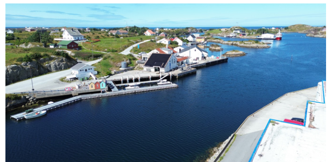
Nikkøy, Bulandet: visitors' pontoon near supermarket and café

Add Ferry to Hardbakke. From Hardbakke, bus to Krakhella, then fast ferry to Bergen (see p.153,).