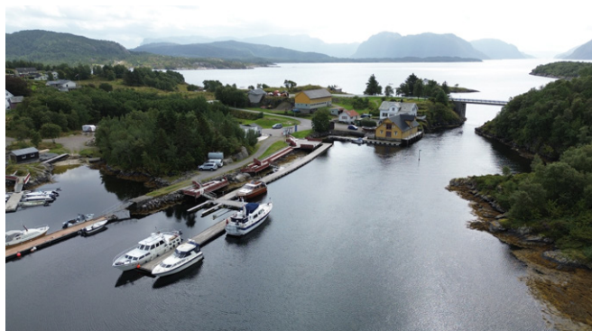
Korssund looking SE to 8m bridge John Sadd

Almost landlocked anchorage in inlet between Klenevågen and Vågane, S of Vilnesfjord, between M (Hellershamn) and Dalsford on plan. Straightforward entry from Vilnesfjord from WNW, minimum depth 3m. Two charted rocks (4.2m and 3.2m) before entering main pool. Anchor in 7.4 m.