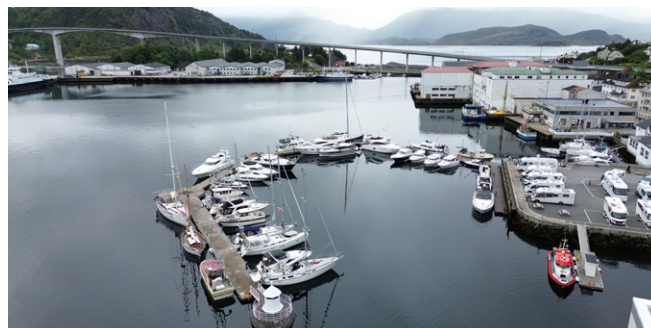
Måløy visitors' marina looking SE towards 40m bridge John Sadd

Add Express boat to Bergen, express bus to Oslo.