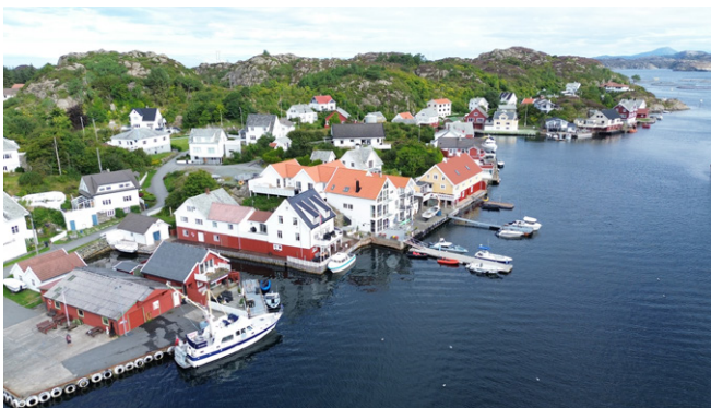
Espevær looking NW; visitors' berths alongside white-painted tyres

No bank. Restaurant in former post office open weekends and some weekdays (mid June to mid August).