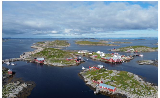
Sørkjæslingan looking NE. Guest pontoon on left, between Nakken (Na) & Lyngnesholm John Sodd

The guest pontoon is 50m long, with water but no electricity. Pay mooring fee at part-time shop/museum (Buttik). Generator providing the island's electricity in NE corner of guest harbour runs 0730-2300. Between mid-September and mid-May, the island has no electricity and is closed. Last paragraph Showers and toilets near ferry terminal.