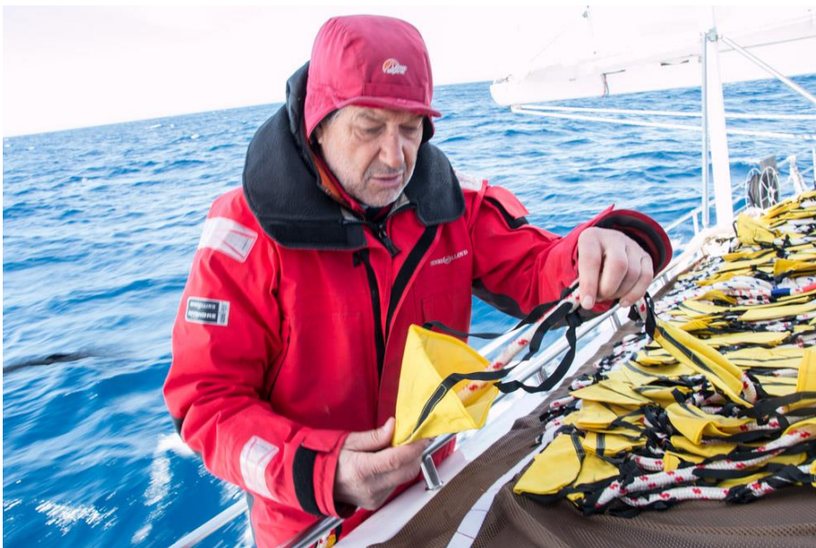
It is essential that the materials used on the cones can withstand the forces exerted

The JSD is a “one size fits all” solution for various wind strengths and wave heights and therefore the drogue should be over engineered to suit hurricane force winds with reinforced anchor points, sufficient length between the bridle and the first cones and strong fabric used for the cones themselves. There is also some debate about how much weight is required to keep the JSD below the surface in all conditions. From the feedback from others and my own experience the weights suggested on the websites are on the light side and I and others have added extra weight to keep the drogue trailing below the surface. Also, each vessel is different in handling characteristics, layout, etc so a suitable method for storage, launch and retrieval for one boat may not suit another.