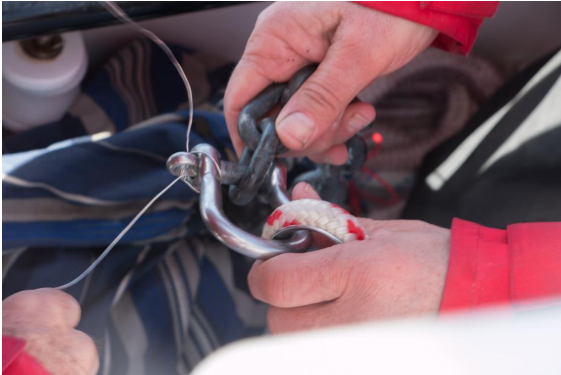
All shackles should be moused